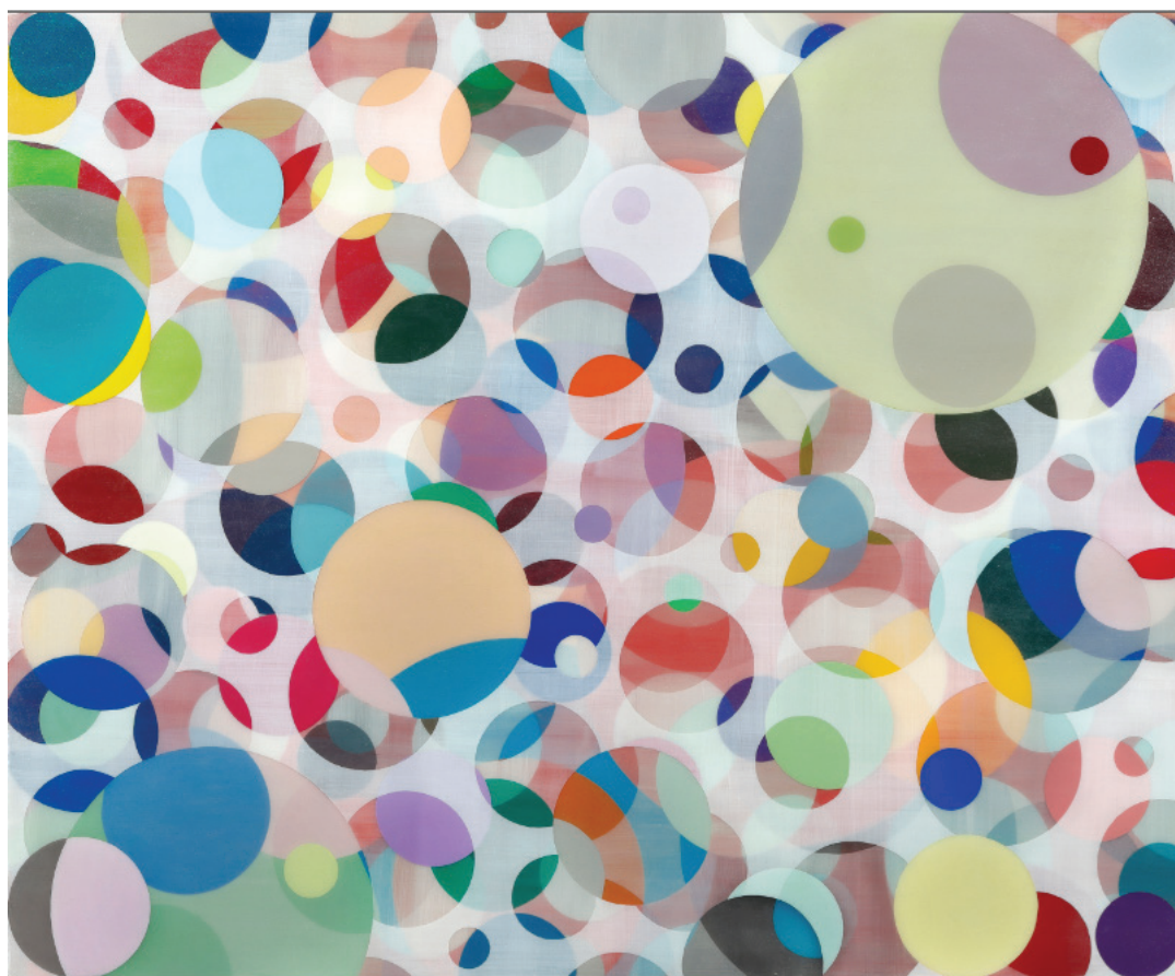
↑ Untitled - 012_2018_Acrylic on canvas_140 x 170 cm

山本雄基以圓形為創作的起始是因為圓形是每個人都知道但匿名性卻很高，沒有方向性的造型。因此以他個人來說，對於形狀所持有的偏見與感情的影響將會降至最低。而以宏觀的角度來說，宇宙的大規模空間也是以圓形當作基礎孕生，以圓形當成元素，作品本身也面臨極大的挑戰，就像是幾何學或是曼陀羅等都是由圓形而來的知識與作品。他的作品會反應出像是自己的生活風格與思考模式。獲得日本大黑屋大賞的作品名稱為「曖昧的泡沫，能看見的地方」，當中所謂的「曖昧性」一直是他作品重要的元素，而曖昧在肯定的涵義裡，現實的烏托邦才得以成立。